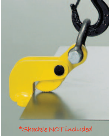
*Shackle NOT included

The THK horizontal plate clamps share the same basic design features as the CH range of clamps but have a reversed tooth jaw design. This safety feature is designed for use with thin sheets which may have a tendency to deflect or sag or flex.