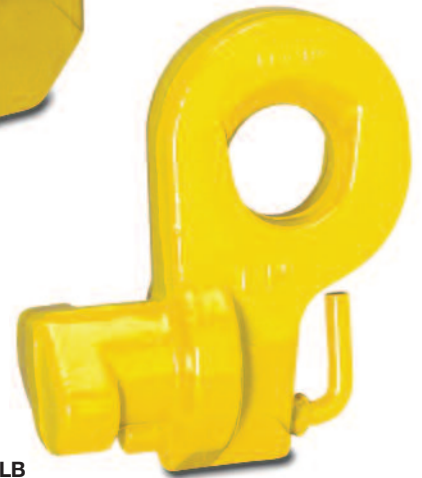
CLB for side lifting