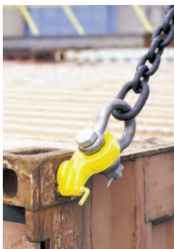
Container lifting lug CLB