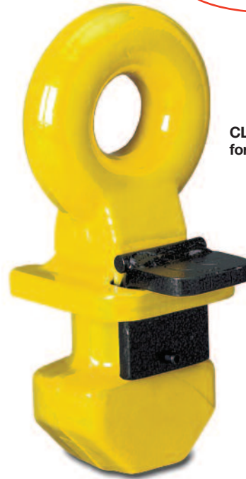
CLT for top lifting