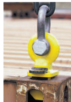
Container lifting lug CLT