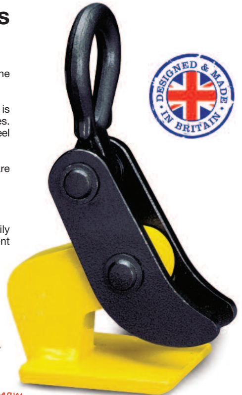
For long plates use spreader beam