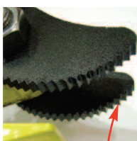
CH with serrated jaw which can only be used for single plates, NOT bundles

These plate clamps are service-friendly, making it easy to exchange parts, which are readily available. Clamp repairs are available through the factory, or can be done by a competent person.