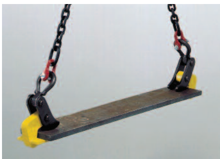
*Chain slings NOT included