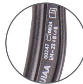
Individual serial numbers