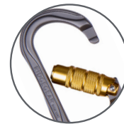
Triple action closure and anti-snag design