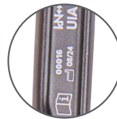
Individual serial numbers