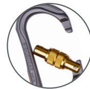
Screwgate closure and anti-snag design