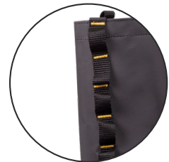
Attachment points on outer bag