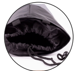
Secure drawstrings closure