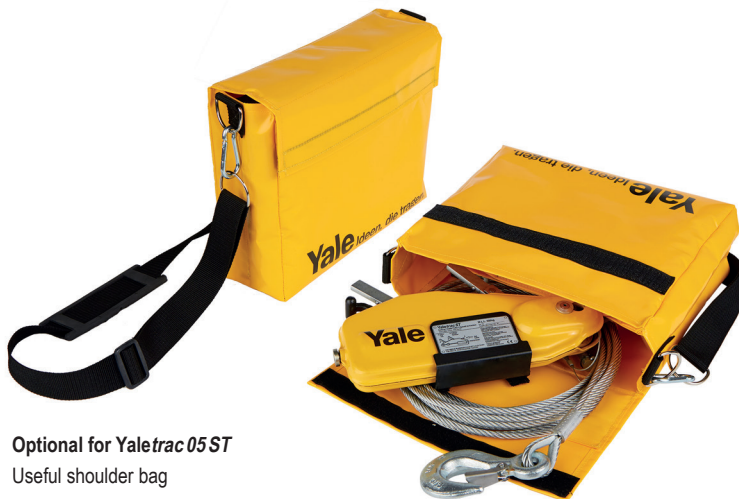
Optional for Yaletrac 05 ST Useful shoulder bag

MODEL UPGRADING NOW ALSO AVAILABLE: 500 daN PULLING FORCE! FOR MOBILE USE