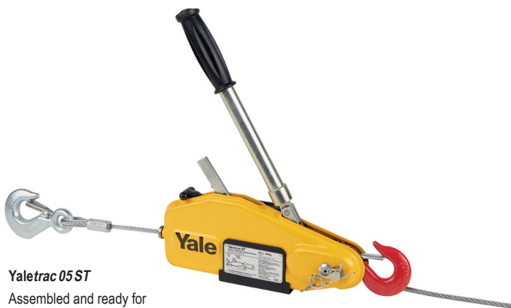
Yaletrac 05 ST Assembled and ready for operation (installed)