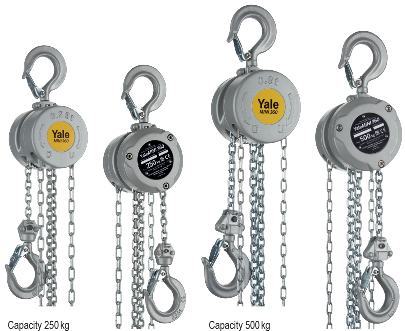
Capacity 250 kg