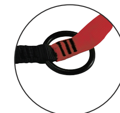
50mm 'O' ring