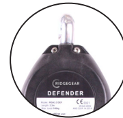
Top swivel for additional connection