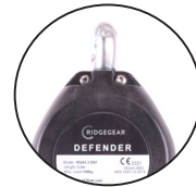
Top swivel for additional connection