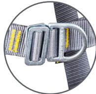
Front attachment point