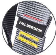
Rip stitch indicators