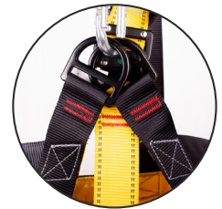
Three D rings (metal) for anchor connection