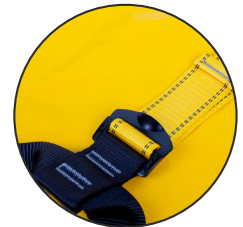
High visibility colouring