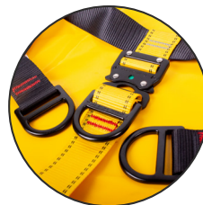
Colour coded stitch patterns and webbing