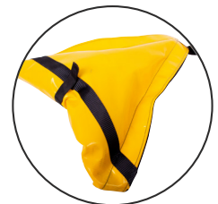
Self storage pocket