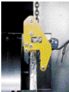
TWG modified side plates for use in confined spaces (e.g. lathe machine).